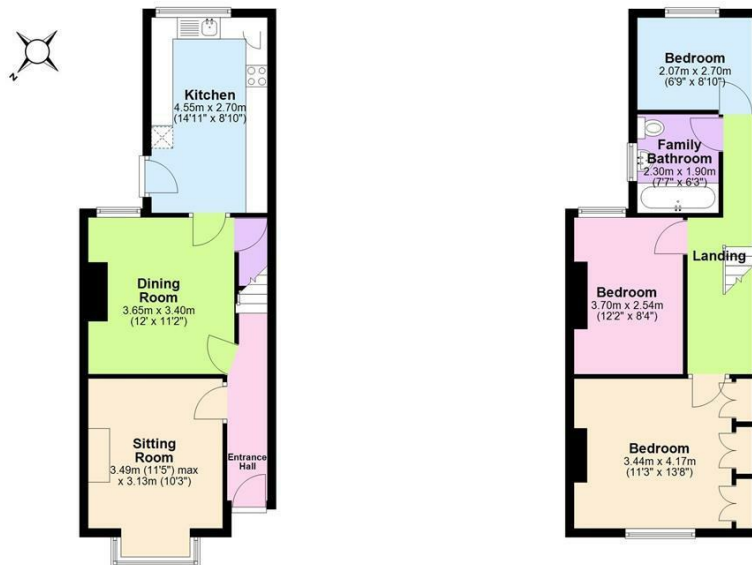
Total area: approx. 98.2 sq. metres (1057.4 sq. feet)