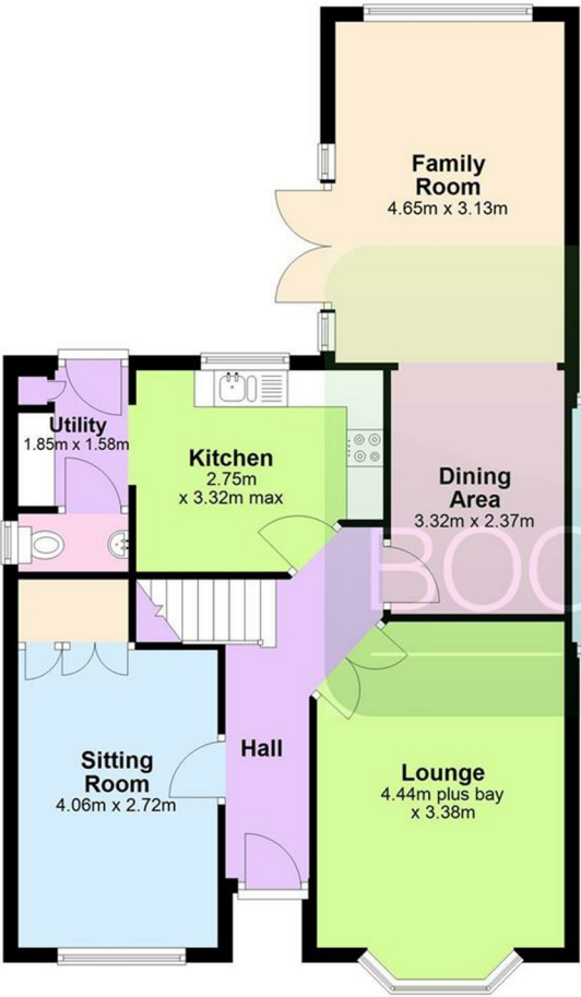
Ground Floor Approx. 76.2 sq. metres